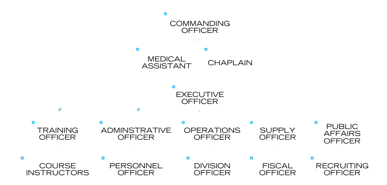
Figure 2: Typical Officer Chain of Command Diagram

The chain of command for the officers and instructors of a U.S. Naval Sea Cadet Corps unit, like the cadet chain of command, is the line of authority and responsibility along which orders are transmitted. Not all units have the same structure, so the chain of command for the local unit may be quite different from the example provided below. These differences are often due to the size of the unit, the availability of adult volunteers, and the skills of those who do volunteer. The figure below provides an illustration of a typical unit's chain of command structure.