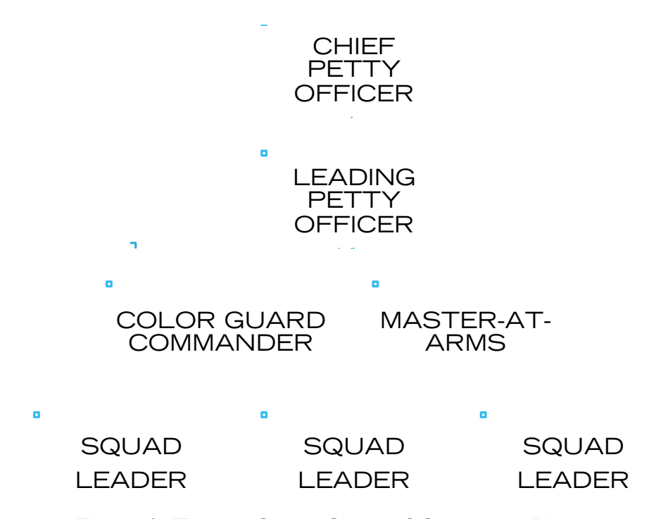
Figure 1: Typical Cadet Chain of Command Diagram

The following figure illustrates an example of a chain of command within a unit that includes the cadet ranks. Not all units have the same chain of command structure, so the cadet chain of command for the local unit may be quite different from this example.